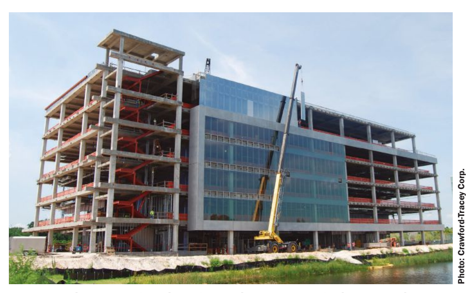
The Adventist Health Solutions Center in Altamonte Springs, Fla., includes Crawford-Tracey's non-impact, insulating Pro-Tech 7SG glazing system, which was installed using a crane.

Curtainwall also includes pressure plates along the mullions and longer mullion depths, often assembled with shear blocks, due to the higher design pressures associated with these systems. Window walls do not require pressure plates and are assembled with